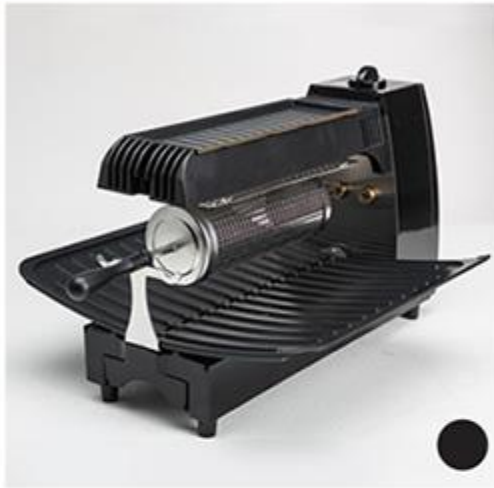
BRATEN Eco-green Grill (Black)