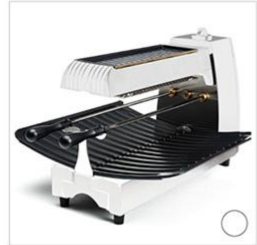
BRATEN Eco-green Grill (White)