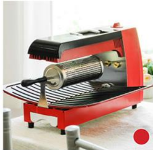
BRATEN Eco-green Grill (Red)